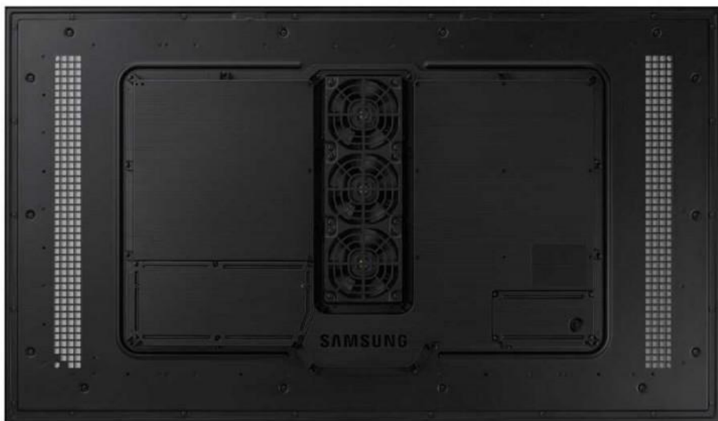
BACK (WITHOUT WALL MOUNT)